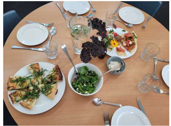
Murrumbeena Primary Cooking