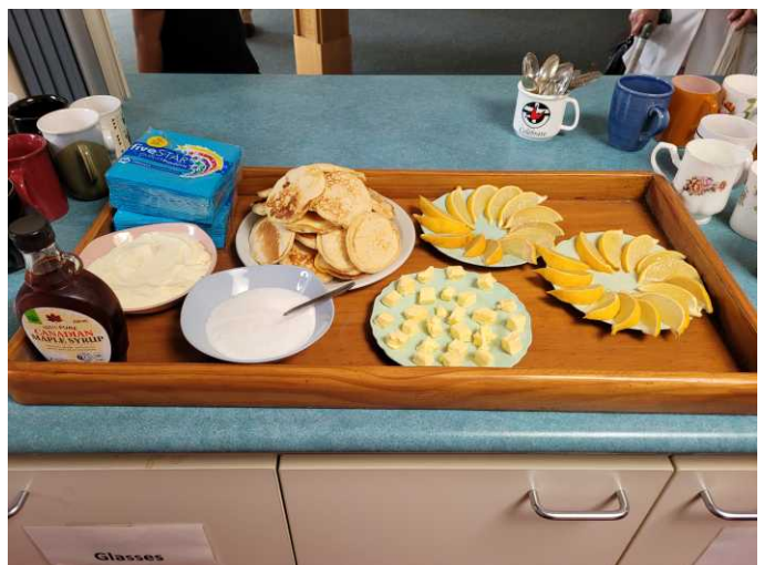
Shrove Sunday - ta da!