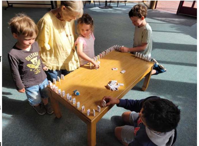
Great wall of dominoes