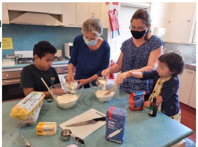
Shrove Sunday - making