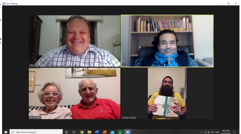
Screenshot of the MUC Parents Prayer Group Zoom meeting